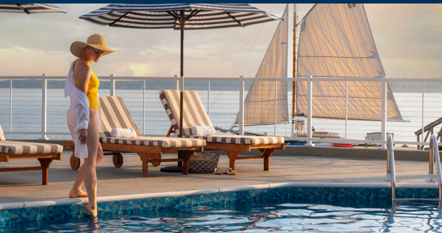
Oceanside Memories Made in Maine

88 Grandview Avenue Boothbay Harbor, Maine 04538 207.633.4152 | 800.553.0289